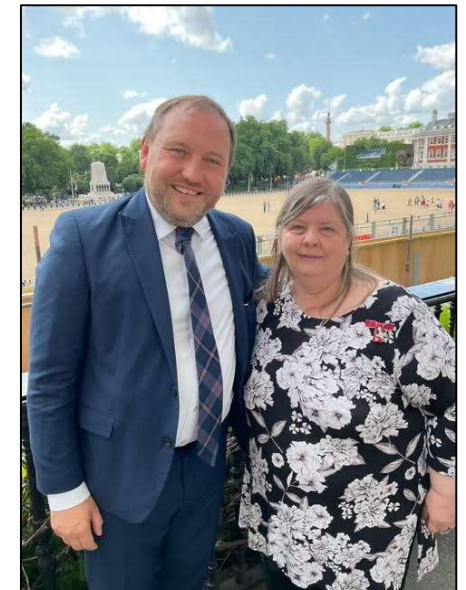
Rt Hon Ian Murray, Secretary of State For Scotland and I on the balcony of Dover House at Trooping the Colour Parade.

The Honours list showcases the remarkable achievements of individuals across Scotland who have gone above and beyond in their respective fields. Their service to our communities represents the spirit of dedication and excellence that makes Scotland proud.