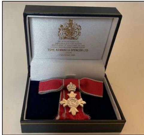
Miniature version of MBE medal (bought from St Paul's Cathedral gift shop)

I have yet to receive a date for the Investiture but am already looking forward to the Ceremony which will be at Buckingham Palace, Windsor Castle or the Palace of Holyroodhouse.